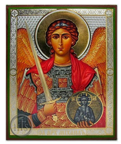
St MICHAEL "Who is like unto God "

The following is a list of the Archangels recognized by the Orthodox Church. These names are mentioned by St.Dyonisios the Aeropagite and they also appear in the Canon to the Bodiless Heavenly Powers. Their icons are available for purchase from Holy Trinity Store