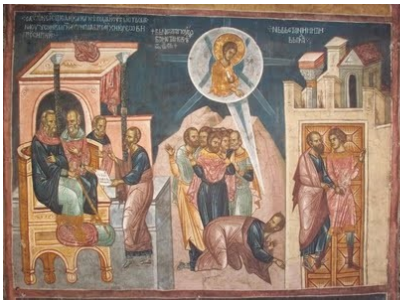
Fresco from Decani Monastery depicting St. Paul (then Saul) and the high priests, Christ appearing to Saul, and proceding to Damascus blind

The Holy Apostle Ananias of the Seventy - Commemorated on October 1