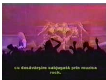
cu desăvârșire subjugată prin muzica rock.

The next song of an Australian band says: "Do what you wanna do and be what you wanna be". Another singer says: "I am free to do what I want, to be what I want, at the hour I want and to choose what I want". The more we listen to this music, the more we feed our mind with thoughts which are against God's will. In the world there is undoubtedly a great tolerance towards these conceptions, which generalize more and more and which finally will lead to destruction.