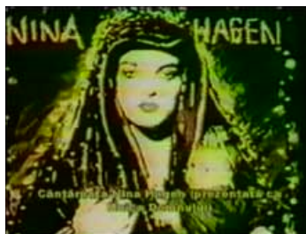
the singer Nina Hagen (depicted as The Mother of God).