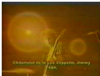
Chitaristul de la Led Zeppelin, Jimmy Page.

Led Zeppelin's guitarist, Jimmy Page, lives in Crowley's old house. David Bowie mentions him in one of his songs, Beatles presents him on the cover of one of their albums,