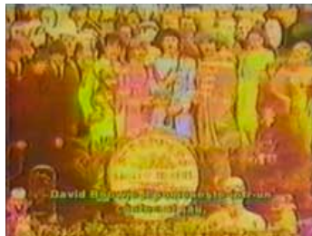
David Bowie prezintă Crowley în albumul său.

Led Zeppelin's guitarist, Jimmy Page, lives in Crowley's old house. David Bowie mentions him in one of his songs, Beatles presents him on the cover of one of their albums,