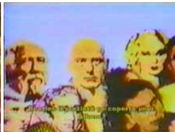
Crowley este prezentat pe coperta unui album.

Ozzy Osbourne has a song named "Mr. Crowley".