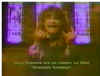
Ozzy Osbourne are un cântec cu titlul "Domnule Crowley".

Ozzy Osbourne has a song named "Mr. Crowley".