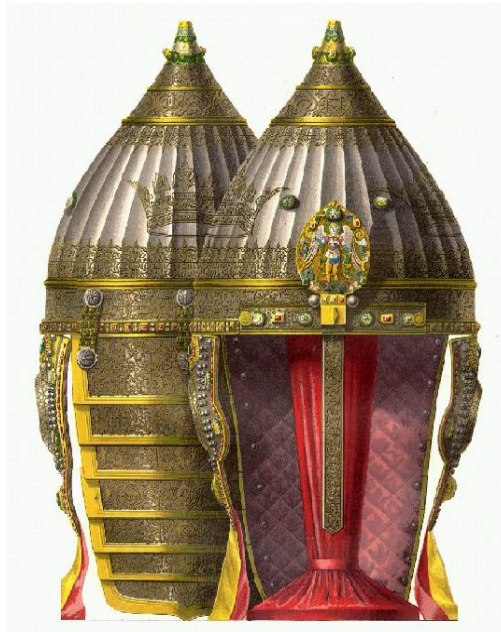
The helmet worn by St. Alexander Nevsky had three inscriptions: Help from God An imminent victory And grant this to true believers

To preserve the integrity of the frontiers of Novgorod it only remained for Alexander to put an end to the invasions of the Lithuanians who in a poorly defended region had for many years past waged a kind of guerrilla warfare. In 1242, as the Lithuanian pressure increased, Alexander destroyed, one after another, seven of their detachments by using in a defensive war his tactics of lightning attack. In 1245, having repulsed a further invasion, he no longer had anything to fear from this quarter. Lithuania gave up annoying her neighbors.