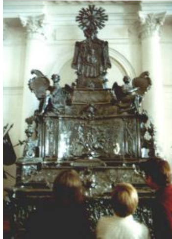
Sarcophagus of St. Alexander Nevsky located in St. Petersburg.

"The sun has set over the land of Suzdal", exclaimed Metropolitan Cyril in announcing the death of their leader to the dismayed people. Alexander's funeral took place with great solemnity. Legend asserts that when he was placed in the coffin and as the Metropolitan endeavored to place between his fingers the prayer of absolution, according to the custom of the Orthodox Church, the dead man opened his hand and seized the sheet of parchment. Subsequently, numerous miracles occurred at his tomb. He was canonized locally in 1380 and by the whole Russian Church at the Council of 1547. Five centuries after his death, following the victorious outcome of his war against Sweden, Peter the Great caused the relics of St. Alexander Nevsky to be translated to the new capital of St. Petersburg where they lie today at the Lavra that bears his holy name.