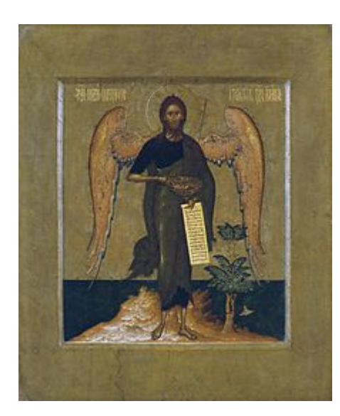
In those days came John the Baptist, preaching in the wilderness of Judaea, And saying, Repent ye: for the kingdom of heaven is at hand.

Wherefore, my beloved, as ye have always obeyed, not as in my presence only, but now much more in my absence, work out your own salvation with fear and trembling.